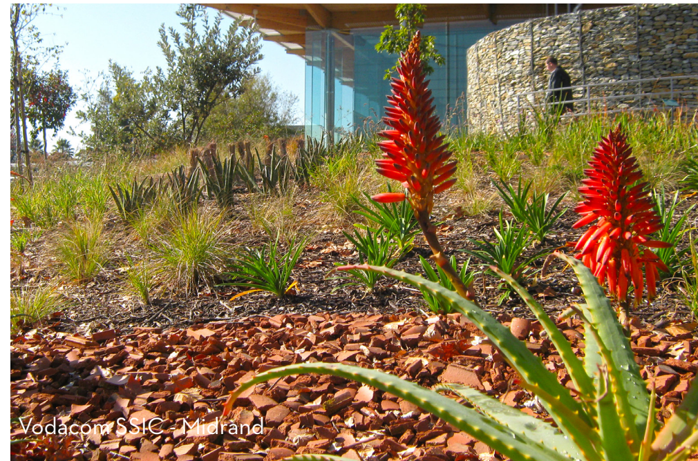
Vodacom SSIC - Midrand

Nasrec Precinct Landscape Design & Installation Landscape Architects for Soccer World Cup Nasrec Rand Show Road Landscape upgrade Nasrec Promenade Bridge Landscape Nasrec Transportation Hub and Landbou Road Landscape Nasrec Stadium Avenue and National Road Nasrec Golden Highway (Street Planting) League Avenue and Soccer City Venue Nasrec Platforms and Parking - FIFA Compliance Nasrec Land adjacent to the Promenade