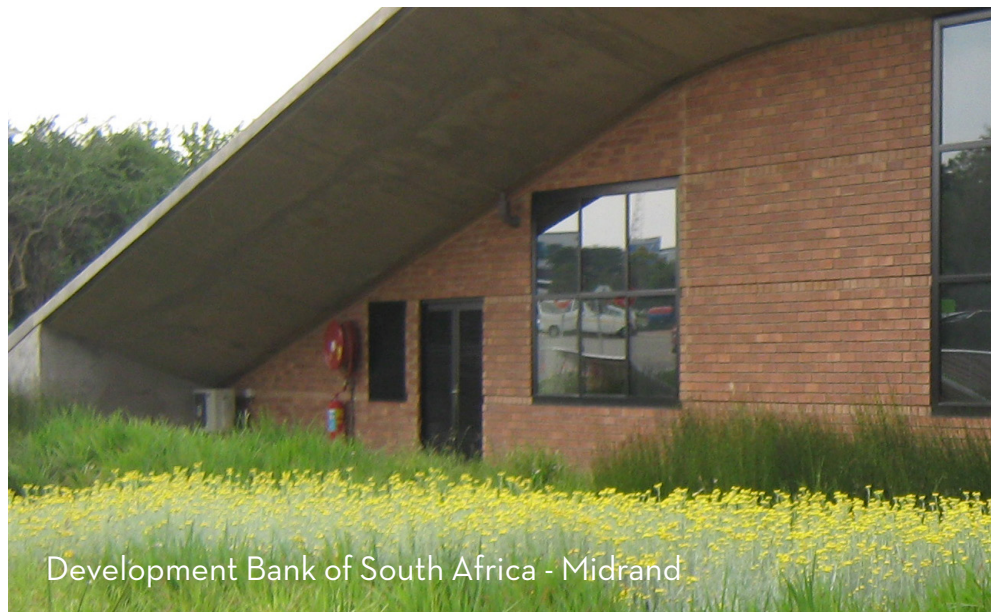
Development Bank of South Africa - Midrand

Achimota Retail Centre- Accra, Ghana Atholl Square Shopping Centre - Atholl Bagatelle Mall of Mauritius - Mauritius Brits Mall - Brits Brooklyn Bridge - Pretoria Bushbuck Ridge - Mpumalanga Centurion Mall - Centurion Design Quarter - Fourways Design Square - Brooklyn Eldo Glen - Wierda Park Eden Meadow Shopping Centre - Edenvale