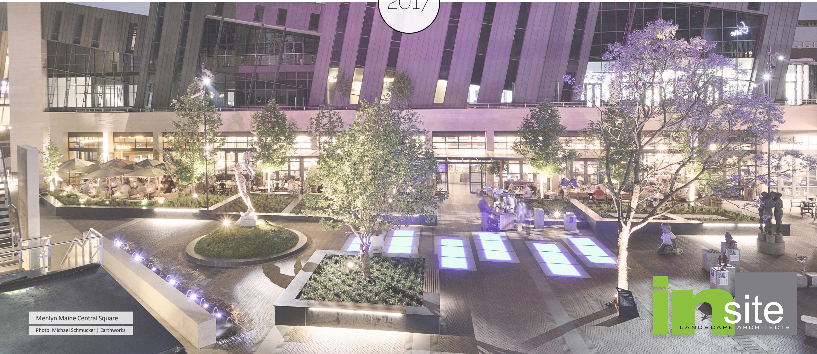
Menlyn Maine Central Square